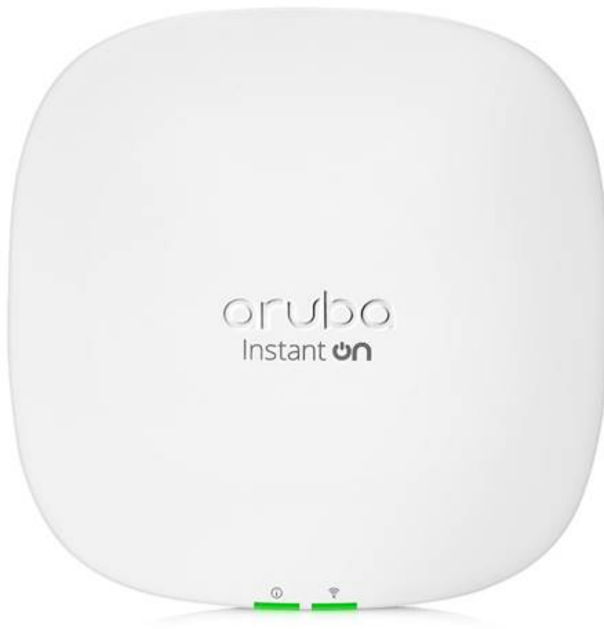
Aruba Instant On AP25 Indoor Access Points